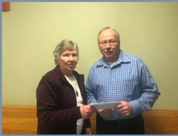
Central New Brunswick Nursing Home wishes to thank the McNamee Women's Institute for the donation of $12,500 towards our Van Fund!

Santa came to visit the residents and left cheques for the van fund too! Thank you to The United Church and Boiestown Seniors Group for your generous donations!